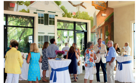
Table Sponsor $900